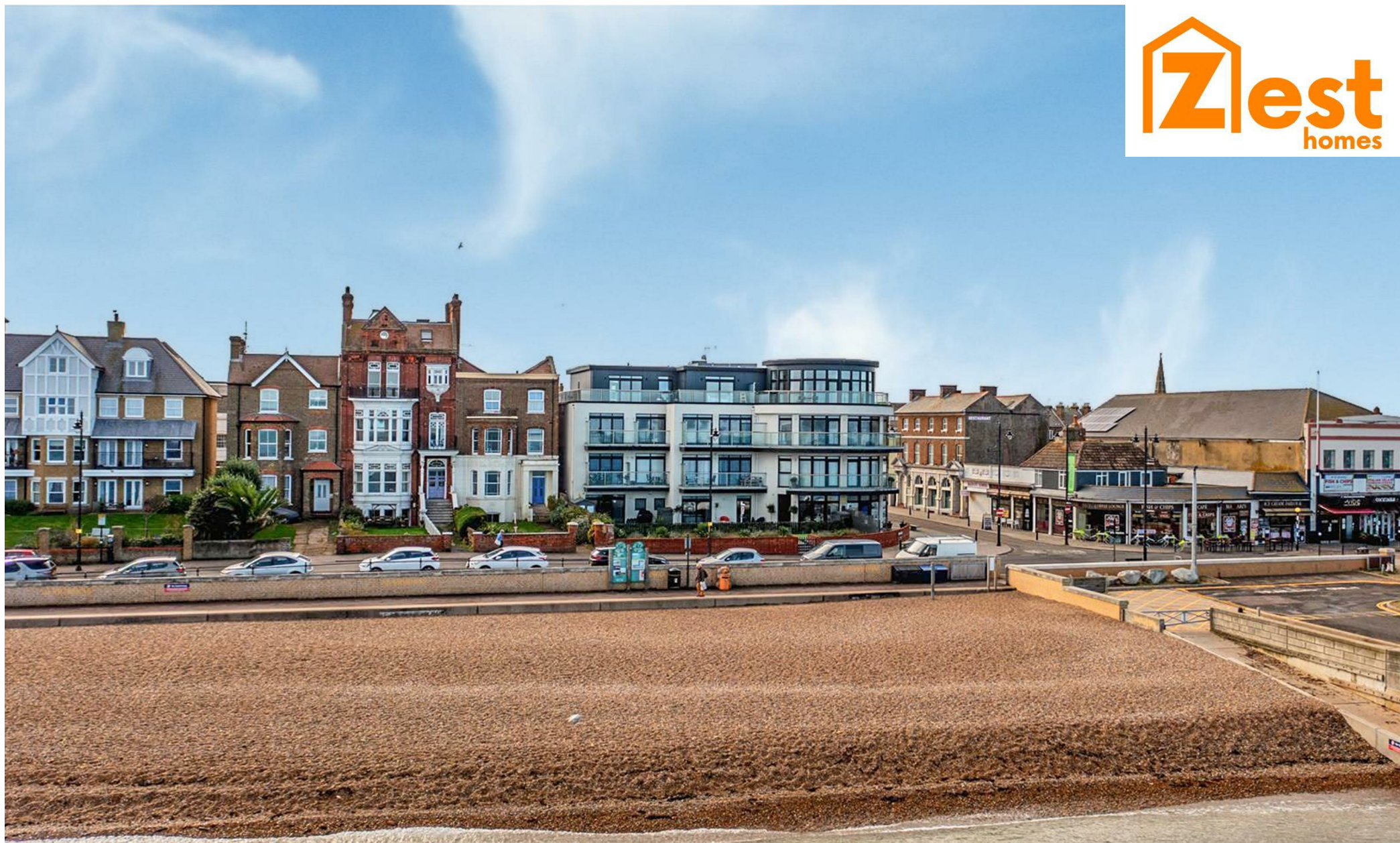
8 Bun Penny Apartments William Street, Herne Bay, CT6 5EW £500,000